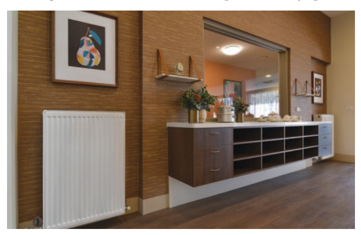
The joinery incorporated storage wherever possible. The combination of easily-opened drawers, bench tops and open shelving supports ease of access, visual cueing and independence for residents

plan living and dining areas are divided into zones to make it easier for residents to recognise what each space is used for. Furniture and accessories are placed in such a way as to facilitate simple decision making and provide cues for task participation by residents. The carefully delineated spaces also provide a sense of intimacy and domestic scale.