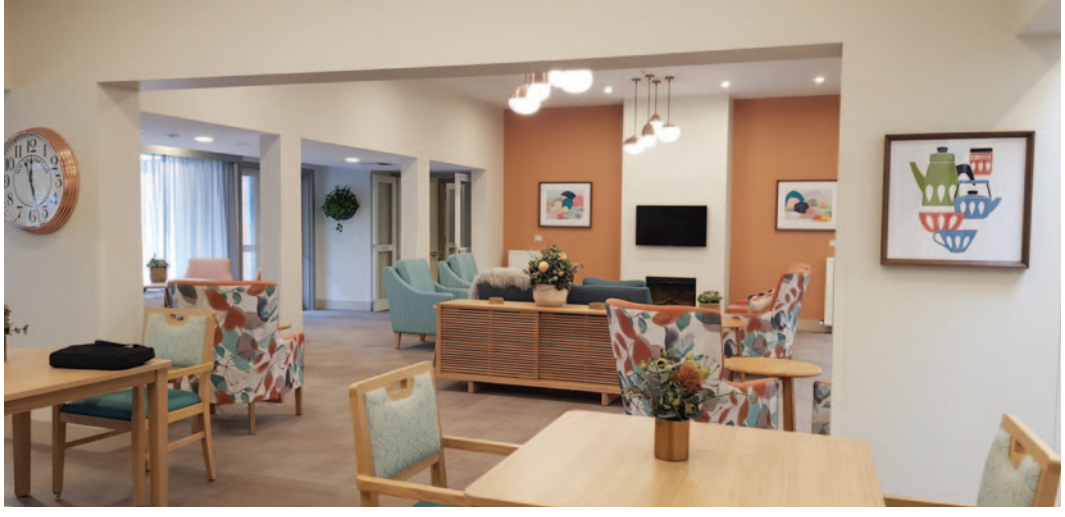
The open plan living and dining areas add the following to end of caption are divided into zones to provide cues for residents

Architectural features and finishes were selected to be hard-wearing whilst echoing the design aesthetic. An